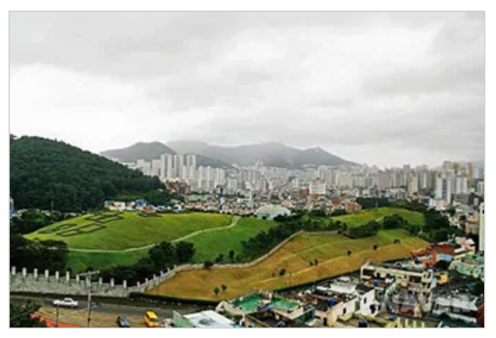
Busan - Past & Present